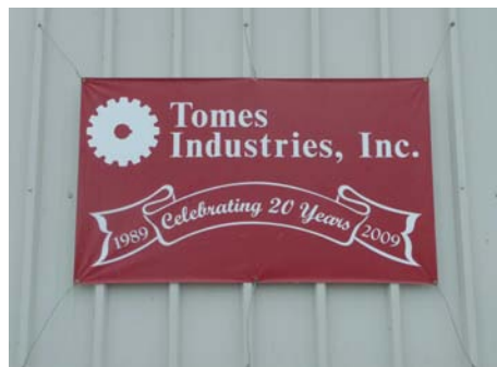
Tomes Industries, Inc., celebrated 20 years in November 2009.

Quality and affordability have always been our forte and we intend to continue to provide the very best possible product at a reasonable price to all of our customers.